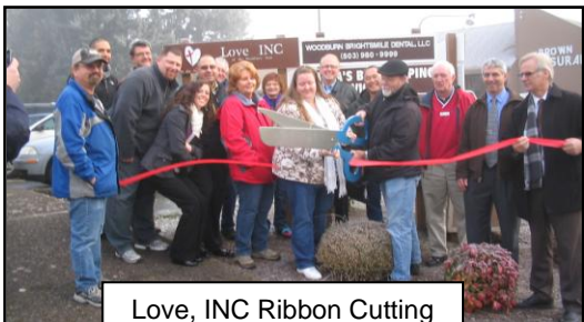
Love, INC Ribbon Cutting