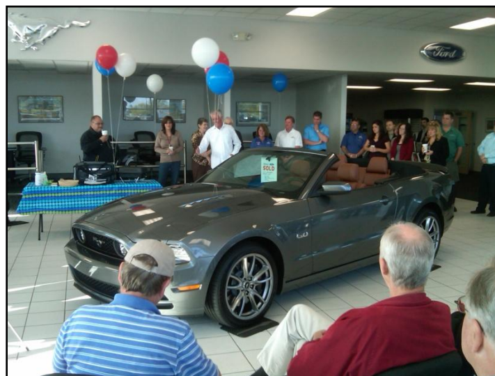
Greeters at Hillyer's Mid City Ford